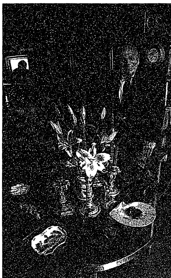
ABOVE Stanley Barrows in his dining alcove with a still life of 19th-century candlesticks and bronze dogs.

RIGHT Tableau of mother-of-pearl objects.